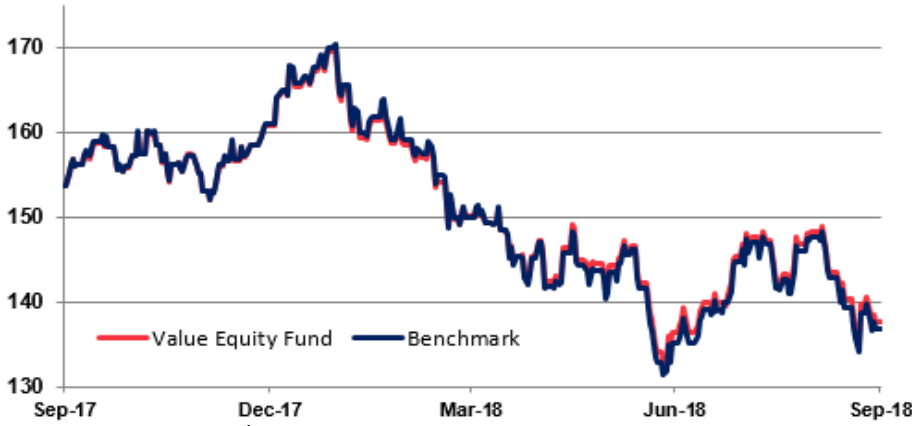
Cumulative Performance 1 (%)

(Purely for reference purposes and is not a guarantee of future results) NAVPU Graph